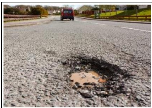
Fig. 1.1: Pothole

We designed a Semi-Automatic Robot which will detect the pothole on the road, and will discharge the required amount of concrete to fill the pothole and to do a level ling process on the discharged concrete using the slider. Therefore the pothole on the road (Fig.1.1.Pothole) may be filled completely and hence the accidents occur due to the pothole may be reduced.