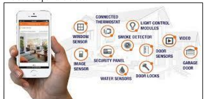
Fig. 1.1: Home Automation System

As I mention in the introduction that automatically it should control and operate remotely the lights and security like doors open and close.