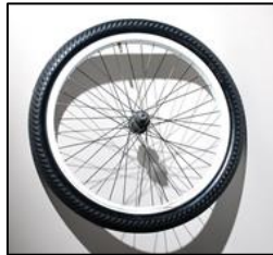
Fig. 2: Wheels