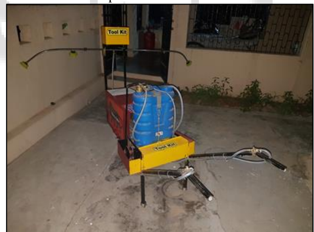
Fig. 1: Actual Photo of Automatic Agriculture Pesticides Spraying Machine

The machine consists of the main body frame, Nozzles, Pipes, Wheels, Tank, piping, pressure control valve, chain and spocket, shaft. This is the single wheel drive machine.. Frame is made up of mild steel. Its width 90 cm, length 180 cm and height is 70 cm. The main frame is covered from all the sides with steel sheets. Vertical arms are attached at end of front side of main frame, carrying horizontal arm. The nozzles are fitted to the pipes which are attached with the vertical and horizontal arm. The horizontal arm is movable on vertical arm. The tank is kept at the backside of the body. The mechanism is kept on the tank.