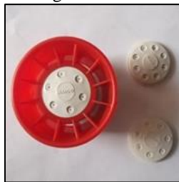
Fig. 3: Nozzle