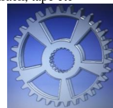
Fig. 1: Sprocket gear

Sprocket are used in bicycles, motorcycles, cars, tracked vehicles, and other machinery either to transmit rotary motion between two shafts where gears are unsuitable or to impart linear motion to a track, tape etc