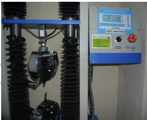
Fig. 1: UTM Instron 1195

The tensile test was performed in the universal testing machine (UTM) Instron 1195. The tensile test is generally performed on flat specimens. A thin flat strip of material having a constant rectangular cross section is mounted in the grips of a mechanical testing machine and monotonically loaded in tension while recording the force. The ASTM standard test method for tensile properties of fiber resin composites has the designation D 638 with the cross head speed of 15 mm/min. The commonly used specimen for tensile test is the dog-bone type. The dimension of specimen was (128×13×4) mm.