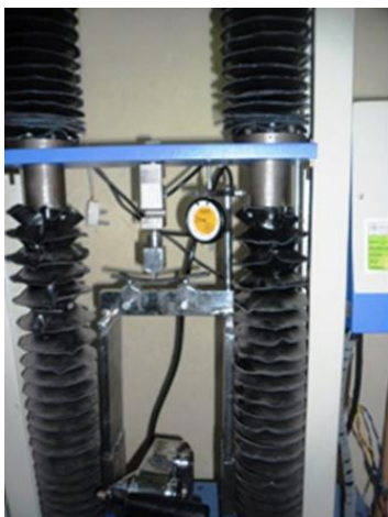
Fig. 2: Point Bending Machine

Flexural strength is a 3-point bend test, which generally promotes failure by inter-laminar shear. The flexural tests are conducted to determine the mechanical properties of resin and laminated fiber composite materials. This test was conducted as per ASTM D790 standard using UTM with cross head speed of 1 mm/min. The loading arrangement is shown in figure 2. The dimension of the specimen is (64×13×4) mm.