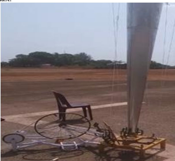
Fig. 2: Bladeless wind mill

The main principle behind bladeless wind generator is the conversion of linear oscillation of mast to rotational motion. As the mast is subjected to wind energy, it tends to oscillate due to the vortices formed around the structure of the mast, which can be converted to rotational force to generate electricity. In the bladeless wind system configuration, the mast is fixed with respect to the ground and the rib structure at the top of the mast comprising of thread arrangement is used for pulling the threads attached to it. Energy is obtained by continuously oscillation of the mast. The mast utilizes wind power to pull the threads along with the chain attached to the sprockets which drive the shaft which intern rotates the alternator to generate power. During the oscillation of the mast, the mast tries to oscillate in any direction depending on the wind direction. The rib structure at the top of the mast is attached with six threads to absorb the energy from the wind. Each set of the thread arrangement of the rib structure corresponds to one sprocket on the shaft which is driven by the chain which is pulled by the thread. Hence three sprockets are available in the shaft out of which, at least one of the sprockets is always in motion during the oscillation of the mast.