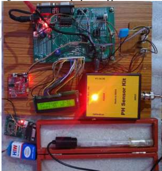
Fig. 3: System Hardware