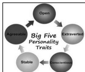
Fig. 1: models five domains of personality, Openness, Conscientiousness, extroversion, Agreeableness, and Neuroticism

Social networking has expanded its reign to an extent that this data if used effectively can build significant applications. The personality insights, tone analysis of a person can be few of these many applications. The proposed system aims at finding the personality traits of a user from his social activities which can be represented using the 'Big Five' model. This model is one of the most well researched