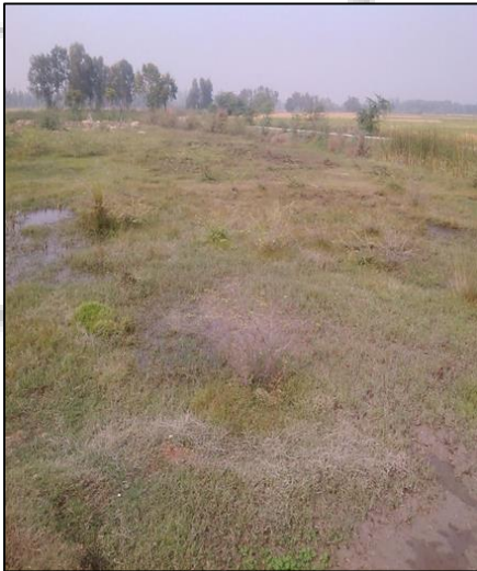
Fig. 1: Water logged Area of Daulatpur Distributaries