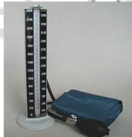
Fig. 1: Sphygmomanometer