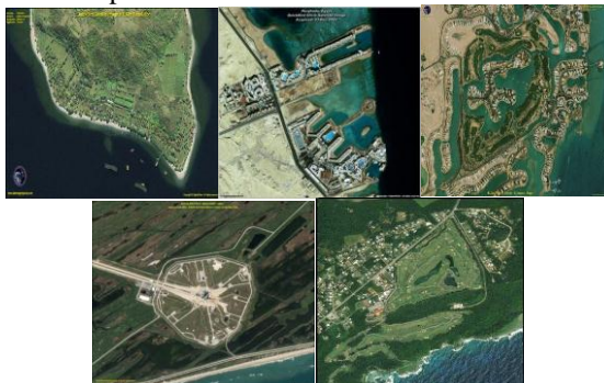
Fig. 3.1: Example Images for Training

The training phase starts by collecting several HR examples. Then features are extracted from this example image, that means the image is divided into small overlapping patches. This work pays attention to how to generate the HR redundant dictionary from the HR examples instead of the LR redundant dictionary. It is different from the previous work. Thus obtain the data-set constituted of local patches. After the data set is obtained, the K-SVD algorithm is used to train these patches to obtain the HR redundant dictionary.