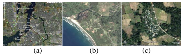
Fig 2.3.1: Input LR Images

In order to evaluate the objective quality of the final images, quality metrics, namely Peak Signal to Noise Ratio (PSNR) is used. PSNR is the quality measurement between the original image and the reconstructed image which is calculated through the mean squared error (MSE). The MSE represents the cumulative squared error between the compressed and the original image, whereas PSNR represents a measure of the peak error. These parameters are calculated as follows: PSNR = 10 \log 2552 / MSE . The PSNR values of the given input images are shown in Table 3.3.1.