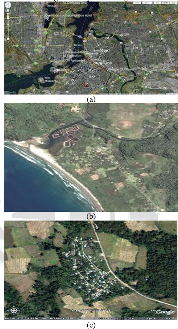
Fig 2.3.2: Reconstructed image after superresolution and denoising