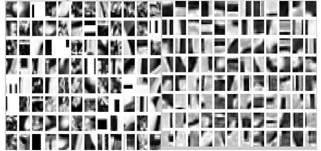
Fig. 3.2.1: (a) Initial Dictionary (b) Trained Dictionary

In the dictionary construction phase, different types of HR training images are collected. Patches are extracted from HR images, and the patches are stored in the dictionary. If trying to store all sort of patches, it would exceed over million pairs. Deleting similar patches enables to reduce the size of the dictionary.