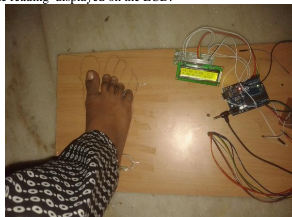
Fig. 2: Output of Foot Pressure

The Diadetics patient can be easily identified by the reading displayed on the LCD.