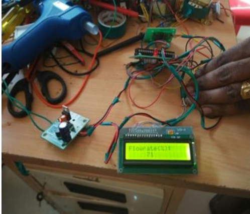
Fig. 2: Display of Blood Rate