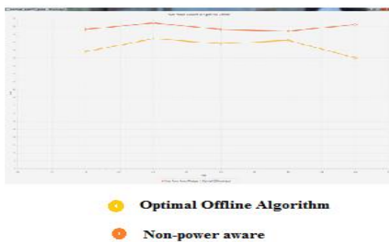
Fig. 3: Bandwidth Consumption

Fig 1.2 shows the calculation of SLA between the cloud data center. It is compared between Non –power aware and Optimal Offline Algorithm. Fig 1.3 shows the bandwidth consumption among Virtual machines in host.