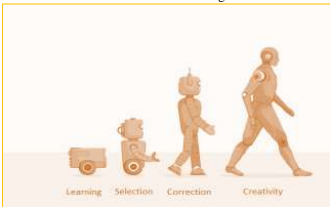
Fig. I: Four major stages of AI programming

There are four major stages of AI programming to make it easier and convenient to the users are given as follows.