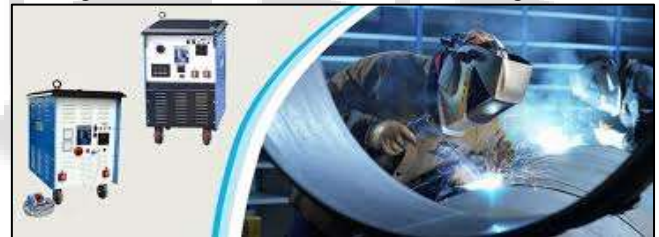
Fig. 1: CO 2 welding for pipes

In CO 2 welding or sometimes electric arc welding the need often arises for welding of circular shape components, where the welding is carried out on the entire periphery or a partial arc length of the job. The electrode is thus moved along this circular path in the conventional method. However, movement of the electrode is much more difficult and it is much easier to index the job. For welding the current work piece Cycle, time is higher i.e. 45-60 sec. So need to develop such a system for easy work piece loading and & auto welding gun positioning. Auto ON/OFF the switches of welding machine to achieve the smooth working.