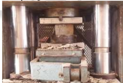
Fig. 2: UTM (Universal Testing Machine)

After completing the casting, 3 days compressive strength of concrete specimens were tested. The specimens were tested in concrete laboratory using UTM (UNIVERSAL TESTING MACHINE). Load was applied over specimen under uniform rate. Load was applied until the signs of failure appeared at cube as shown in figure below. And the compressive strength values of 3 days are given in table no 02: