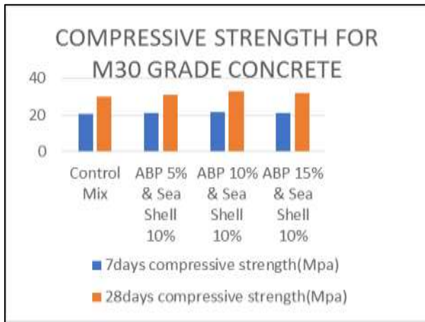
Chart 1: Bar chart of Compressive strength