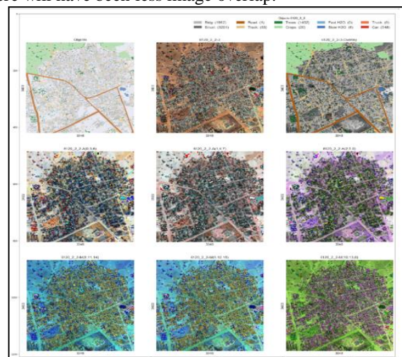
Fig. 3: Data processing and visualization

The Drone collected raw RGB images were inserted to the processing platform which uses photogrammetric image processing algorithms with 90% overlapping, low altitude and high resolution RGB imagery. The mesh can contain artifacts, especially around the edges of the project where there will have been less image overlap.