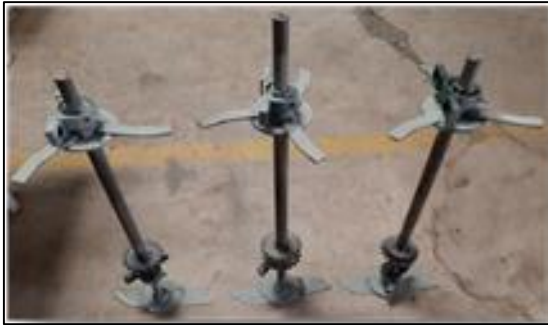
Fig. 6.3: Shaft

Shaft is a main component in this device on which the working component are mounted to perform their work effectively. One shaft is connected to motor with the help of belt drive which transmit power from motor to this shaft.