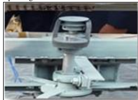
Fig. 6.8: Pulley

Pulley is also the one of the important component of the machine used in this device which helps to transmit the power. There are two pulley is used in this device, one is connected to the motor and second is connected to the middle shaft of the device on which separator and cutter is connected. With the help of 'v' belt two pulleys is connected to each other and power get transmitted.