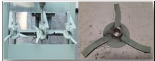
Fig. 6.6: Separator

Separator is also main component of this device, which is also mounted on the same shaft on which the cutter is mounted. Separator is mounted on the top of the shaft to separate the crop after cutting. With the help of rotary motion of this shaft separator separate the cut crops on one side.