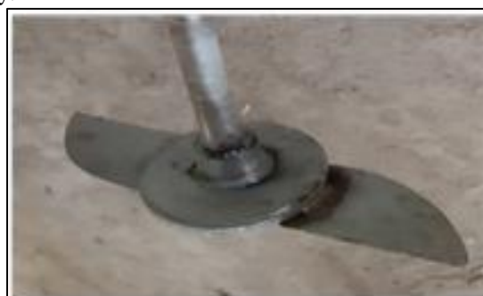
Fig. 6.5: Cutter

Cutter is a main component in this device whose work is cutting crops from ground level curve shape blade with two blades is used in this device to cut the crop. Some inclination angle is provided in this device to cut the crop easily and fastly.