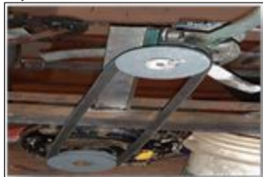
Fig. 6.7: Motor

Motor is also main component of this device; motor is mounted on the frame of the device. The main function of the motor is to transmit power to the shaft to perform the relative operation. 1 hp single phase DC motor is used in this device with 1420 rpm which is sufficient to cut the crop easily and effectively.