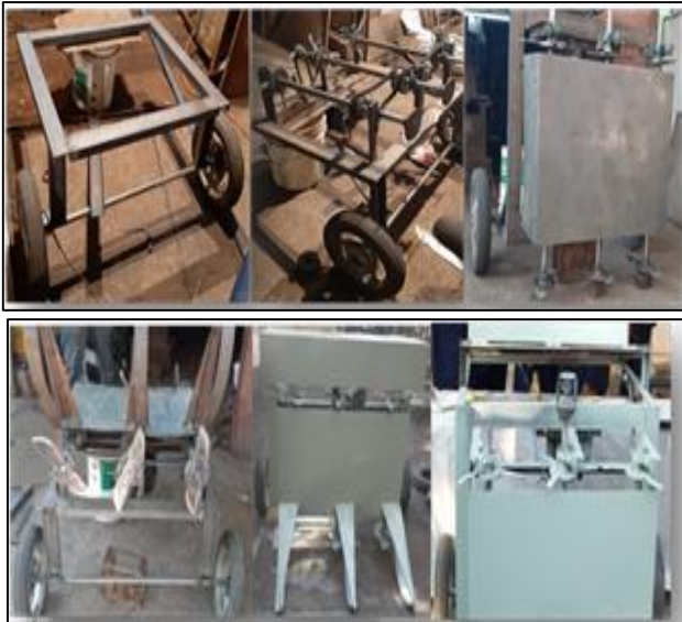
Fig. 7.1: Fabrication and Assembly

The gear is mounted on the shaft on which separator and rotary blades arrangement are provided to transmit power to moving blades. The blades are manufactured by using High carbon steel plate. And cutter sharp edges are produced by grinder. Additional attachment is that the done of metallic sheet that divide the cut crop into besides of crop cutter. Finally all the components are assembled together from base frame, wheels, motor/engine, pulleys, belt, shaft, eccentric disc, separator and rotary blade.