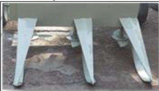
Fig. 6.4: Crop Collector

Crop collector is also the important component of the machine which is connected to the device. The function of this component is to collect the crop and make bunch of it to cut it in a proper way its shape looks like 'v' shape which is help to collect the crop and make a bunch of it.