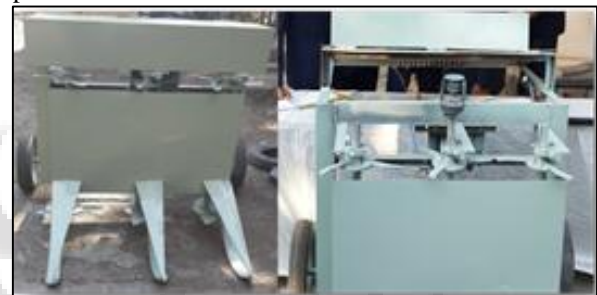
Fig. 6.1: Design of the device

Working principle:- In our concept device crop cutter and separator consist a shaft, cutter /Blades, separator, DC motor, belt drive, chain drive, and wheel. DC motor used in this device use to transmit power to the shaft, there are three shaft is used in this device on the each shaft separator and cutter is attached cutter is attached at the bottom of this shaft to cut the crop from the ground level and separator is attached at the top of the shaft to separate the crop on one side. Crop is cut by the rotary movement of the cutter which helps cutter to cut the crops easily and this rotary movement is achieved by the DC motor used in this device to take continuous rotary movement of this three shaft together this shaft are connected with the help of belt drive and chain drive used in this device