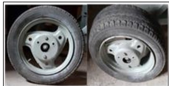
Fig. 6.2: Wheel

Wheel is one of the important component of the machine on the basis of wheel machine is travel around the farm and it help to cut the crop in a particular manner. The wheel helps to push the machine easily as it is connected in the machine in a proper way. Scooter wheel is used in this device as they are more comfortable to work with this in farm.