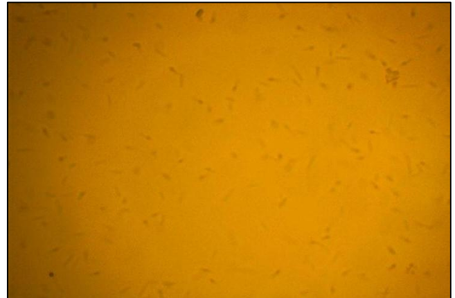
Fig. 5: Microscopic Image of Bacterial growth after incubation

The growth of respective microbes in the culture with oil could be ascertained by the increase in their cell count as observed under the microscope.