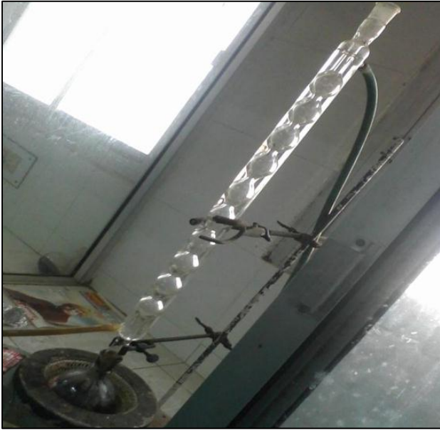
Fig. 3: Reflux apparatus