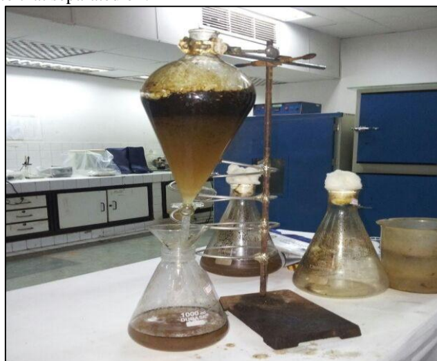
Fig. 2: Separating Funnel Dehydration of Separated Degraded Oil

The PDB treated oil was separated by the separating funnel under the action of gravity and kept undisturbed for a couple of hours which allows complete separation of two clear phase, with oil at the above layer and water at the below. In this process water is separated from the oil by gravity action and oil is collected. After that dehydration process was started to that separated oil.