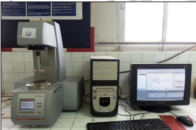
Fig. 4: Anton Paar Rheometer

For measurement of crude oil properties like viscosity, pour point, Anton Paar Rheometer MCR 52 was used in the lab.