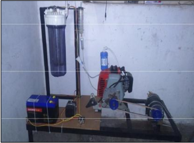
Fig. 2: Experimental Setup

Then this gas is passing through the non-return valve and then carbon filter. In carbon filter moisture and dirt particles will absorb and then supply to the inlet of engine after the carburettor. This supply of HHO gas at inlet of engine helps to improve combustion process and also control the exhaust gas emission.