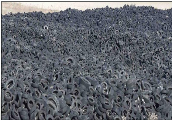
Fig. 1 – Stacked Tyre

fibers, glass fibers and polypropylene fiber. There usage many alter in concrete for differential application. The fibers are selected from their properties like effectiveness, cost and availability. The waste management of used tyre is of major concern for many environmental bodies and agencies worldwide. Tyre production is increasing every year due to the increase of vehicle sales. The generation and disposal of waste are inherent to life itself and have presented very serious problems to the human community. Waste shredded tyres have found their use in various geotechnical applications such as soil stabilization, slope stability, increasing bearing capacity of soil and many more but the steel wires are not being used effectively. Hence an attempt will be made to convert steel wires in to tyre fibers by cutting then in certain aspect ratio so that they can be added into a concrete matrix.