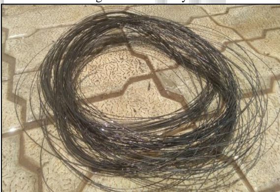
Fig. 2 – Tyre steel fibers