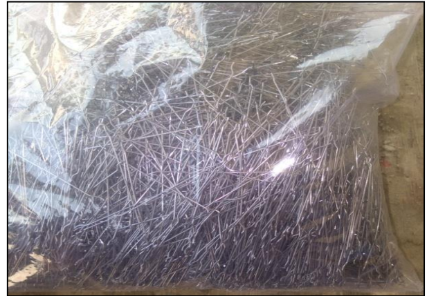
Fig. 3: Industrial Fibers

pieces when the structure is subjected to the peak tensile load and cannot withstand further load or deformation. The fiber reinforced concrete cracks at the same peak tensile load, but does not separate and can maintain a load to very large deformations. Steel fiber reinforced concrete satisfies two of much demanded requirements of pavement material in India, economy and reduced pollution. It also has several other advantages like longer life, low maintenance cost, fuel efficiency, good riding quality, increased load carrying capacity.