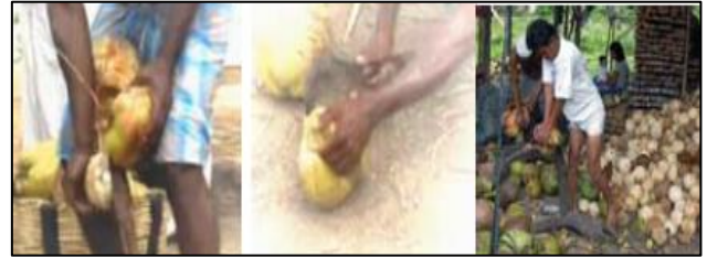
Fig. 2: Conventional Method of Coconut De-Husking