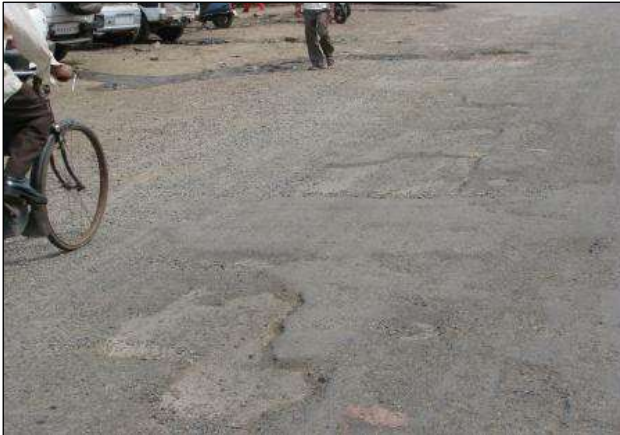
Fig. 2: Loss of aggregates Because Of Poor Drainage