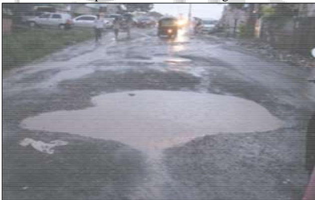
Fig. 3: Loss of Aggregate

This is called as failure due to poor drainage of the roads. The failure pattern is as shown in figure 3 below