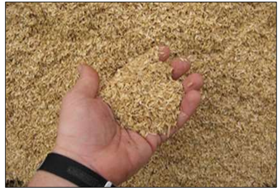
Fig. 4: Rice Husk

As it was discussed earlier every year approximately 770 million tons of paddy are produced globally. The research is being done for usage of this rice husk as one of ingredient of road layers. The sub base layer of road can be prepared by using rice husk.