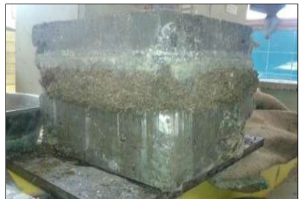
Fig. 5: Use of rice husk in sub base course

Basically this concept is initially followed in rigid pavement of M15 grade concrete and the combination of rice husk and fixing agent in proper proportion. The layer is provided below the first layer which absorbs the percolated water through road cracks.