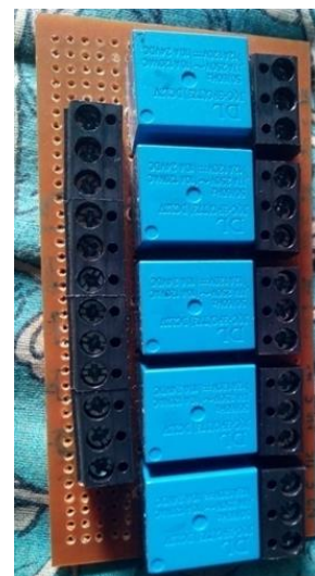
Fig. 3.2: Motor Driving Circuit with Relays