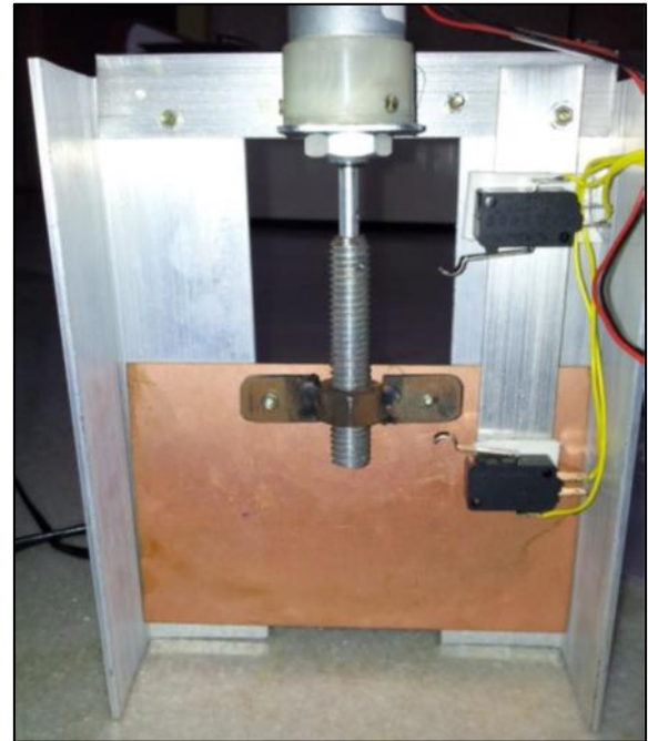
Fig. 3.1: Gate Control Assembly with Motor & Limit Switches

In gate control assembly there are two doors are used in our proposed system. One gate is used for prior level of water in dam which depends on water level detected by level switch 1. And another gate is used for extreme high level of water in dam which depends on level switch 2. The closing and opening of gate is achieved by the dc motor, the motor shaft is connected with the geared belt which placed on gate assembly. The opening of gate also control by timer with required time application. When the gate is fully opened during this stop action of gate will controlled by limit switch. As gate touches the limit switch the trigger plus is applied to the PLC which stops the motor.