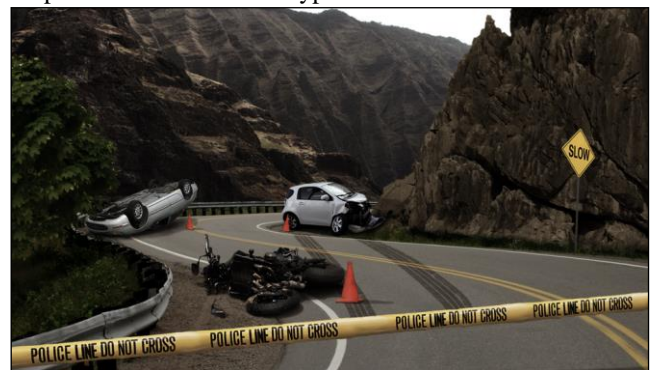
Fig. 3: S curve

Let's introduce S type of curve, in the curve may be in flat road or in sloppy road. In this curve any nature obstacle are there, it can't remove due to obstacle driver can't see the other side of road and it may be accident occur. Here below the picture we can see this type of accident.