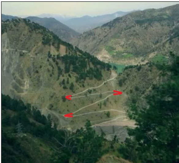
Fig. 1: 1 U pin curve

We are talking about Indian hilly road, which number of accident occur sloppy road curve. When drive can't able to see what come from the other side and accident occur. At hilly region driver phycology is they drive at middle of the road so it can safe. Both the side driver can do same they drive middle of the road and at curve they don't know other vehicle come from the other side and accident occurs.