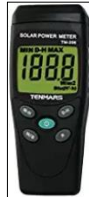
Fig. 1: Tm-206 Solar Power Meter (Pyranometer)

instrument had the options of measuring the global radiation both in W/m 2 and BTU.