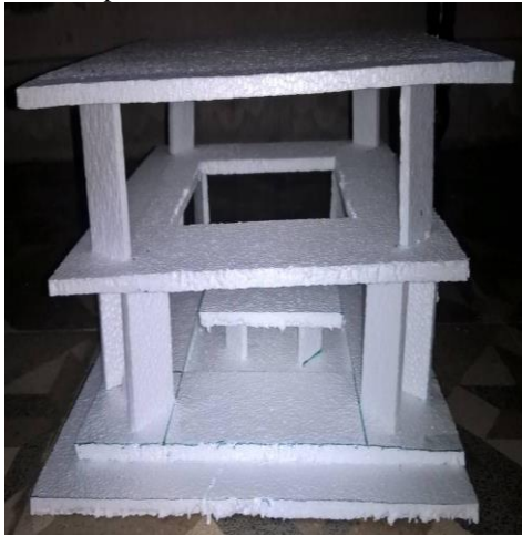
Fig. 1: Prototype of parking system

It is an original or first model of something from which other forms are developed.