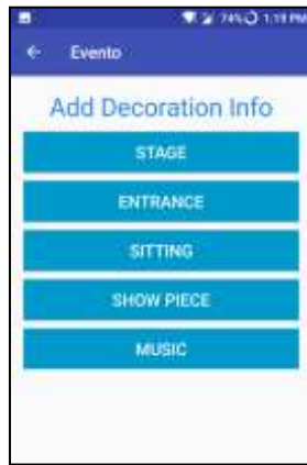
Fig. 4: Decoration module

Decoration module provides details about the decoration provided by hall. The user can select decoration from module as per his choice. There is no interface of event manager here. Decoration module includes decoration regarding to events like wedding, birthday party, theme party etc. with prices.