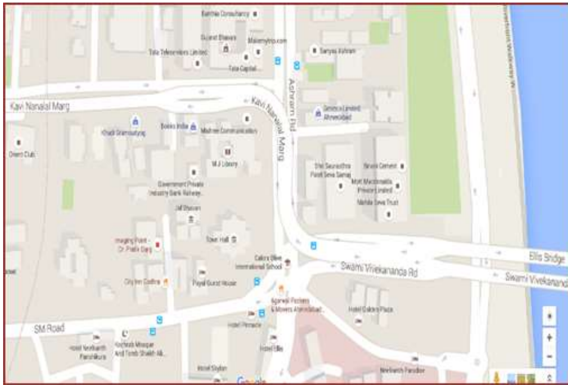
Fig. 1: Google image of study area

The flyover measure 1 km in length, 8.9 meters wide and 2 lane road on each side is provided on the flyover. 30 kmph speed limit is provided on the flyover. Cost of construction of flyover is around 95-100 crore. According to the AMC report, The flyover is beneficial in the future BRT project.