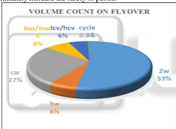
Fig. 3: volume composition on the flyover.

From the graph, curve shows rate of accident is decreasing in succeeding year after the construction of flyover. So there is decrease in the cost of accidents, and ultimately increase the safety of public.