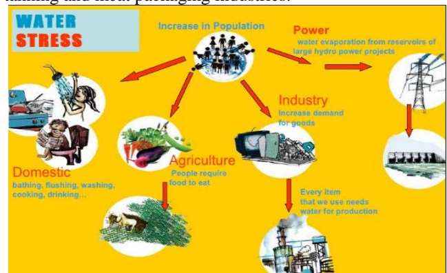
Fig. 2: Major sources of water pollution

A growing variety of contaminants area unit coming into water provides from industrialization and act like serious metals, dyes; pharmaceuticals; pesticides, fluoride, phenols, pesticides, pesticides and detergents. Within the case of prescribed drugs, attention product, hormones, pesticides, and alternative chemical compounds that area unit free into the facility. Unexamined health hazards area unit returning to lightweight that didn't antecedently exist leading to AN increased would like for extra assembly [2]. Several water pollutants stay to be addressed, attributable to speedy industrialization new chemical compounds area unit unendingly being developed and dropped at the market and sooner or later they'll emerge into the aquatic systems. In addition water borne infective microorganism's area unit present throughout the planet. These infective microorganisms enter waterways through untreated biodegradable pollution, storm drains, septic tanks, runoff from farms, and from numerous industries, particularly the tanning and meat packaging industries.