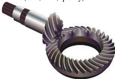
Fig. 1: Bevel Gear with pinion.

Process planning is defined as the systematic determination of the detailed methods by which work pieces or parts can be manufactured from initial stages (raw material form) to finished stages (desired form). The complete process planning is indicating in figure1. Process planning is a result of engineering planning activities of process planners which prepare a list of processes needed to convert a raw material shape as a starting point into a predetermined final shape. A process planner has to consider the mentioned parameter and to propose an optimal process plan. The optimal process plan has to fulfill the selected production criteria (cost, time, quality).