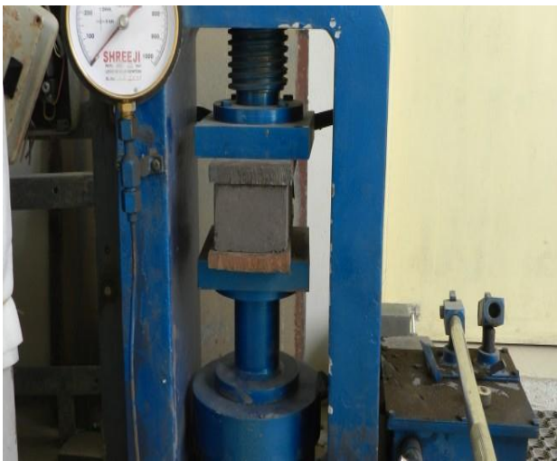
Fig. 4: Compressive strength test