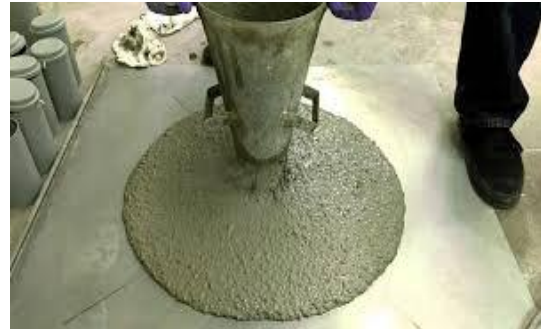
Slump flow test