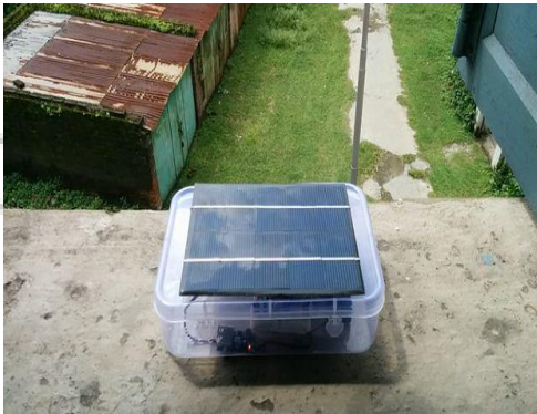
Fig. 3: Solar Panel System in Rural Area

Weather broadcasting system for rural area is very important part of existing system low cost and also it is useful for all people. So related all those things our system is use Solar Panel.