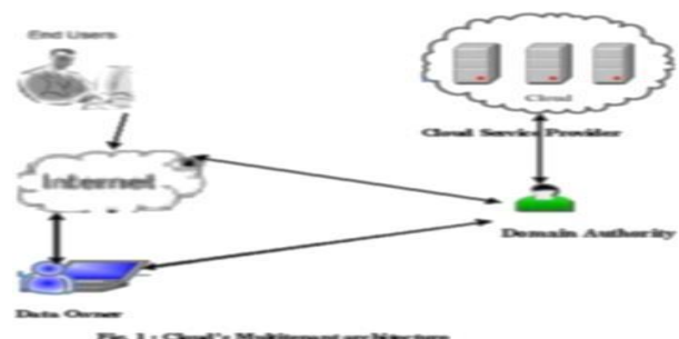
Fig. 1: Proposed Work

will provide means for optimizing the cloud servers. However, the performance of cloud servers are based the number of metrics taken into account and its evaluated results under steady state.