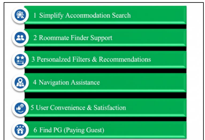
Fig. 2: Main goals of the project

The app provides location-based search to help users easily find available rooms, roommates, or PGs nearby. Integrated with Google Maps, it suggests best routes to the property and shows nearby facilities (colleges, bus stops, gyms, hospitals, etc.). Users can also get alerts if a listed property is in a high-demand area or if new listings become available in their preferred location.