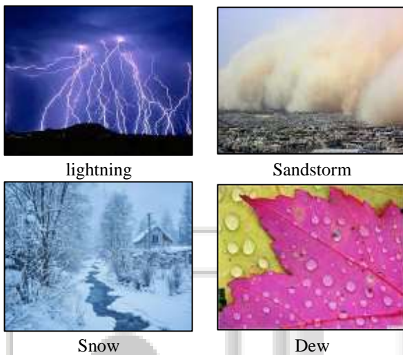
Fig. 1: Samples instance from kaggle dataset[2].

The collected dataset of weather image classification are retrieved from Kaggle repository[2]. The weather dataset contains total of 6862 image sample divided into 11 labels. Some of the image labels such as Dew, Fogsmog, Lightning, Rain etc. The assembled image samples was in the form of imbalanced class. Hence, we applied data augmentation technique to equalize the instance size per class. Zoom, crop, flip, rotation are the techniques utilized over image augmentation. Later, the whole dataset was divided into 80:20% for train and testing sets. Some of the weather samples are shown in figure 1.